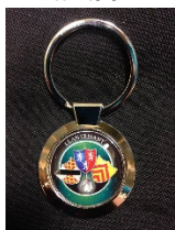
Chrome keyring £3.49