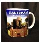
A china mug featuring seven images of Llantrisant £5.99

Llantrisant Guildhall Shop is open for business!