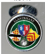
Limited edition cufflinks £24.99