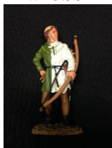
Metal model of bowman £11.99

Find out more about these many bespoke items dean@llantrisant.net